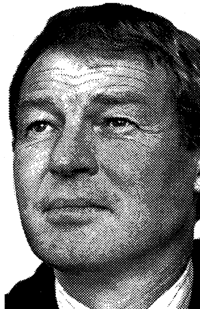
Paddy Ashdown's Liberal Democrats have positive plans to improve the NHS, education and the fight against crime.